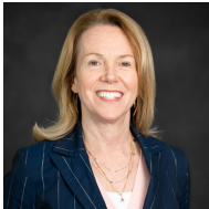
Mary Anne Hiliard Children's National Research & Innovation Campus The Collaboration Award