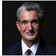
Ted Leonsis Monumental Sports & Entertainment Game Changer Award