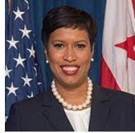
Mayor Muriel E. Bowser Game Changer Award