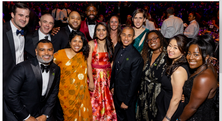
The team of Jair Lynch Real Estate Partners.

In 2023, every one of our networking events reached maximum capacity, underscoring the enthusiasm and engagement within our DC real estate community. The energy at the 2023 DCBIA Achievement Awards was palatable, creating an unforgettable experience for 720 attendees. Even during the challenges posed by the pandemic, our Golf Classic persevered as one of DCBIA's longest-standing traditions. It remained a beacon of outdoor camaraderie and business development connection. Finally, our educational program offerings consistently feature some of the brightest minds in the industry, providing invaluable insights and expertise. Coupled with this energy, DCBIA takes the lead to advocate for the real estate development industry before the Council of the District of Columbia and District government agencies. As we face the challenges and opportunities of rebuilding downtown, and the many seemingly small challenges in well-meaning regulation, now is the time to be involved with DCBIA.