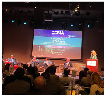
DCBIA CEO Forum 2023