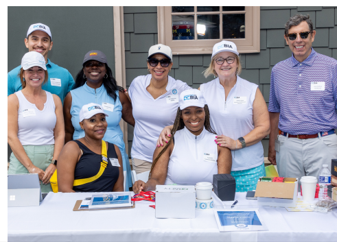
DCBIA Golf Classic Volunteers 2023! Dream Team