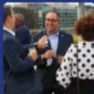
More Business Development