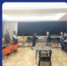
Diversity, Equity & Inclusion