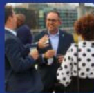
More Business Development